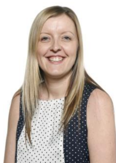
Assistant Headteacher Early Years Leader

We are delighted that you have decided to send your child to Queenborough and we know that they will enjoy their time here. To help settle your child in as easily as possible in September and to ensure that you have all of the information you need about the school, we have produced this booklet to help you. Please complete the admission forms you have been given, together with your child's birth certificate and evidence of your address if not already provided. Please return these forms to the school office by Friday 7 th July .